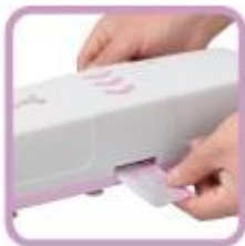
2. Take bag with other hand