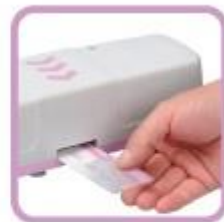
3. Pull bag through. Pills crushed, so simple!