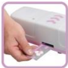
1. Put pills into bag and insert in following arrows